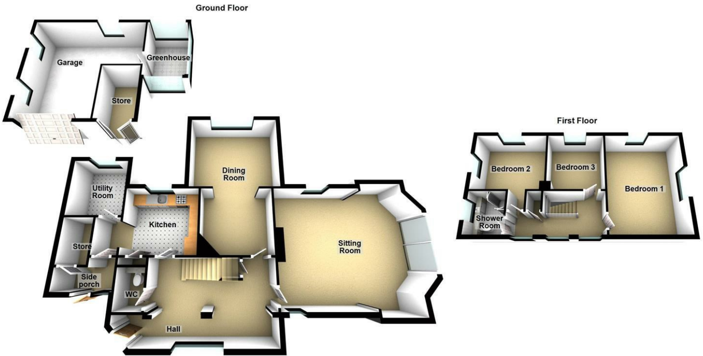
Hill Crest, Bromyard Road, Cradley

These particulars, whilst believed to be accurate are set out as a general outline only for guidance and do not constitute any part of an offer or contract. Intending purchasers should not rely on them as statements of representation of fact, but must satisfy themselves by inspection or otherwise as to their accuracy. No person in this firm's employment has the authority to make or give any representation or warranty in respect of the property.