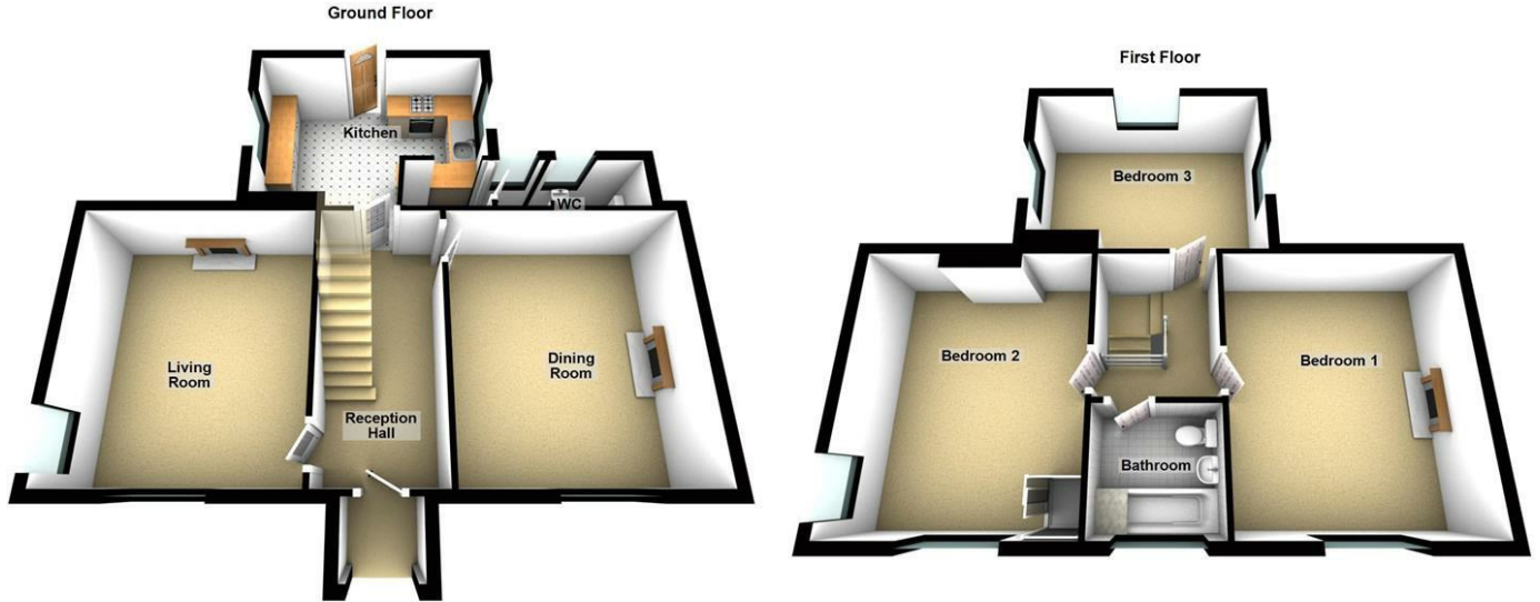
Barnard's Green Cottage, Pound Common, Malvern